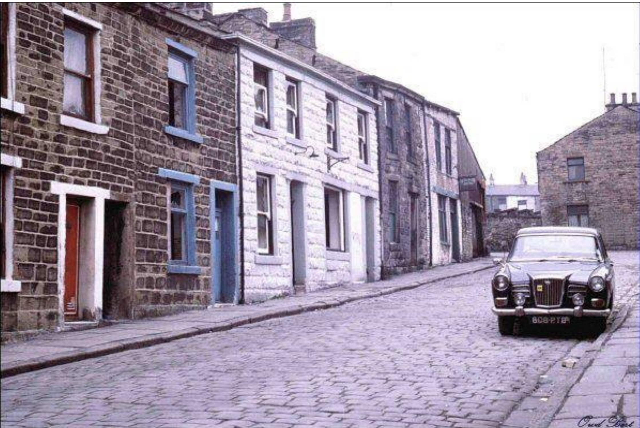
A 15/60 IN ACCRINGTON C.1970