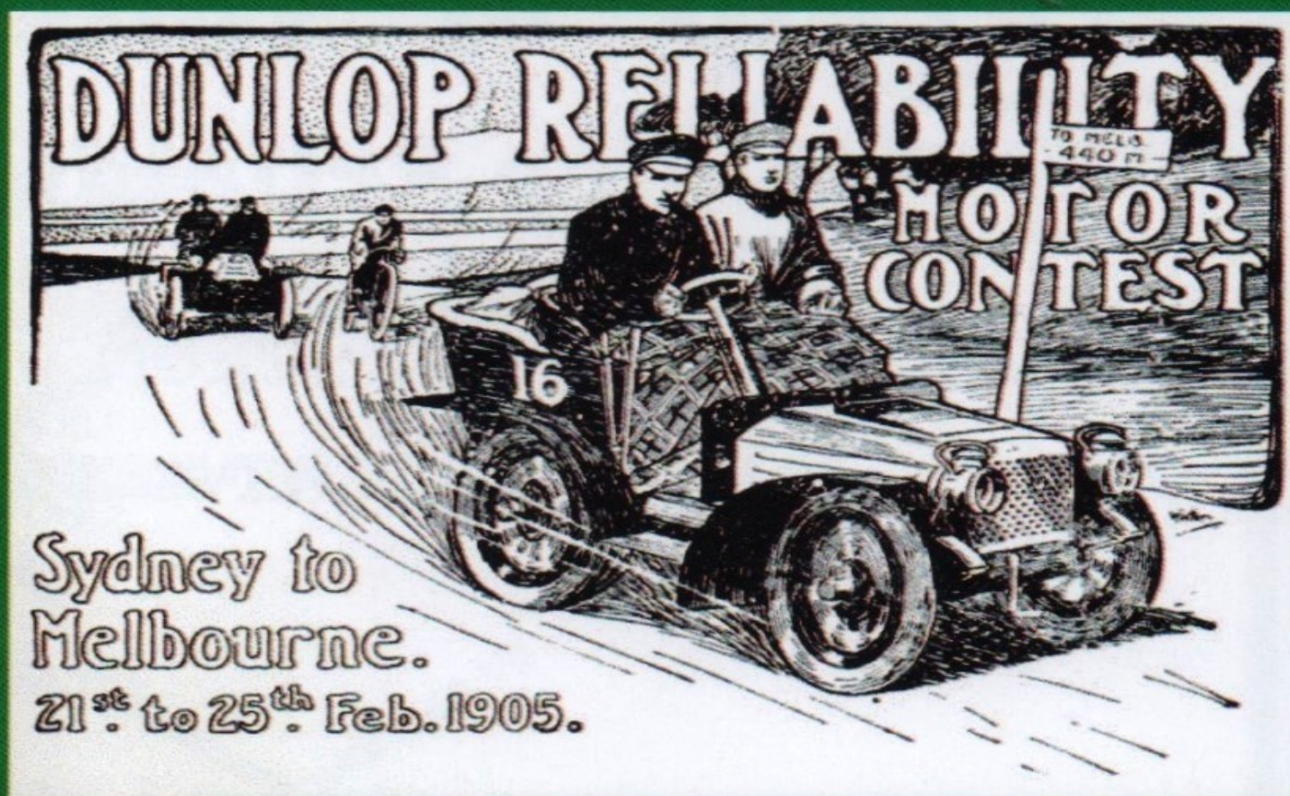
Brochure front page

In February 1905 Florence Thomson was the sole female entrant in the Dunlop Reliability Motor Contest from Sydney to Melbourne. Mrs Thomson was one of 16 entrants who successfully completed the five day trial, driving a six horsepower Wolseley, over what was then nothing more than 562 miles of horse track between the capital cities.